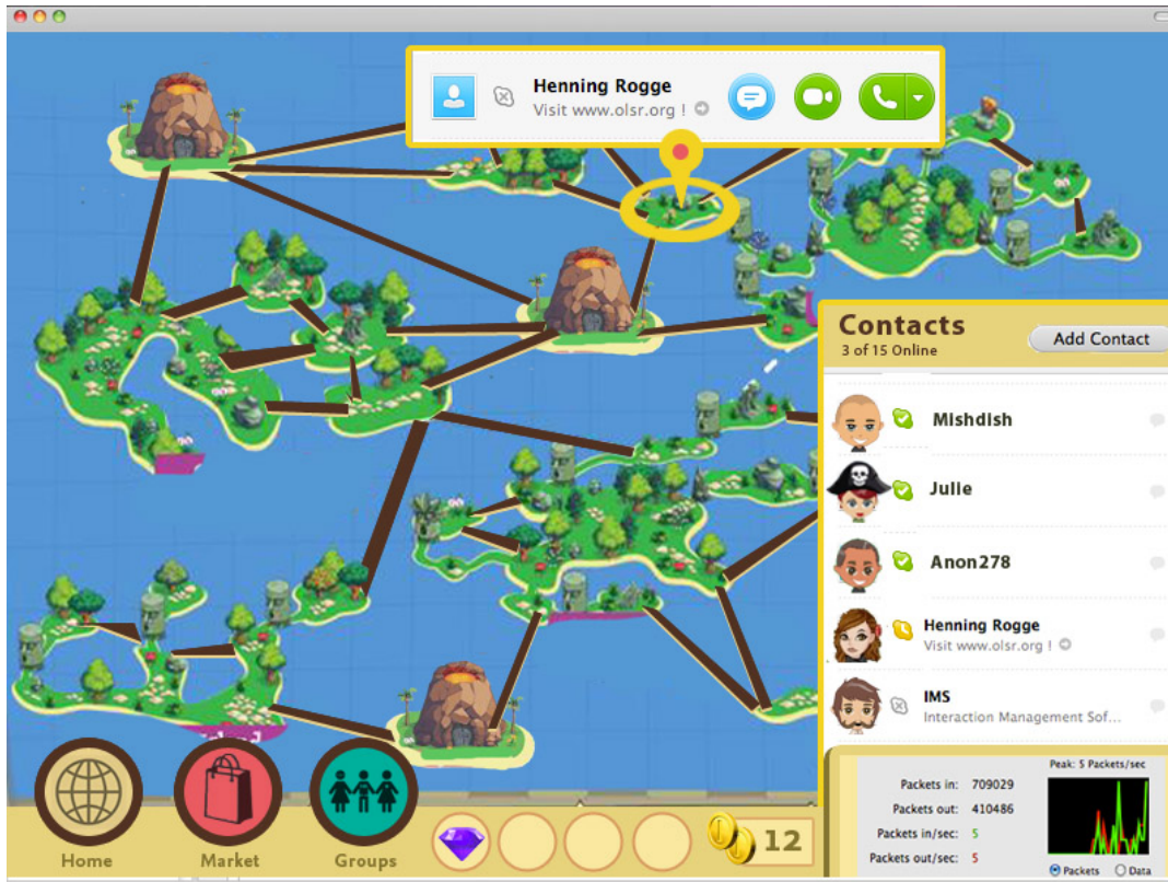
Fig. 4. Mesh community with communication and contacts interface.

To ensure compatibility across all devices, MeshKit will be built in HTML5, which can be ported to mobile devices through the open source Phonegap project or run in any supported web browser.